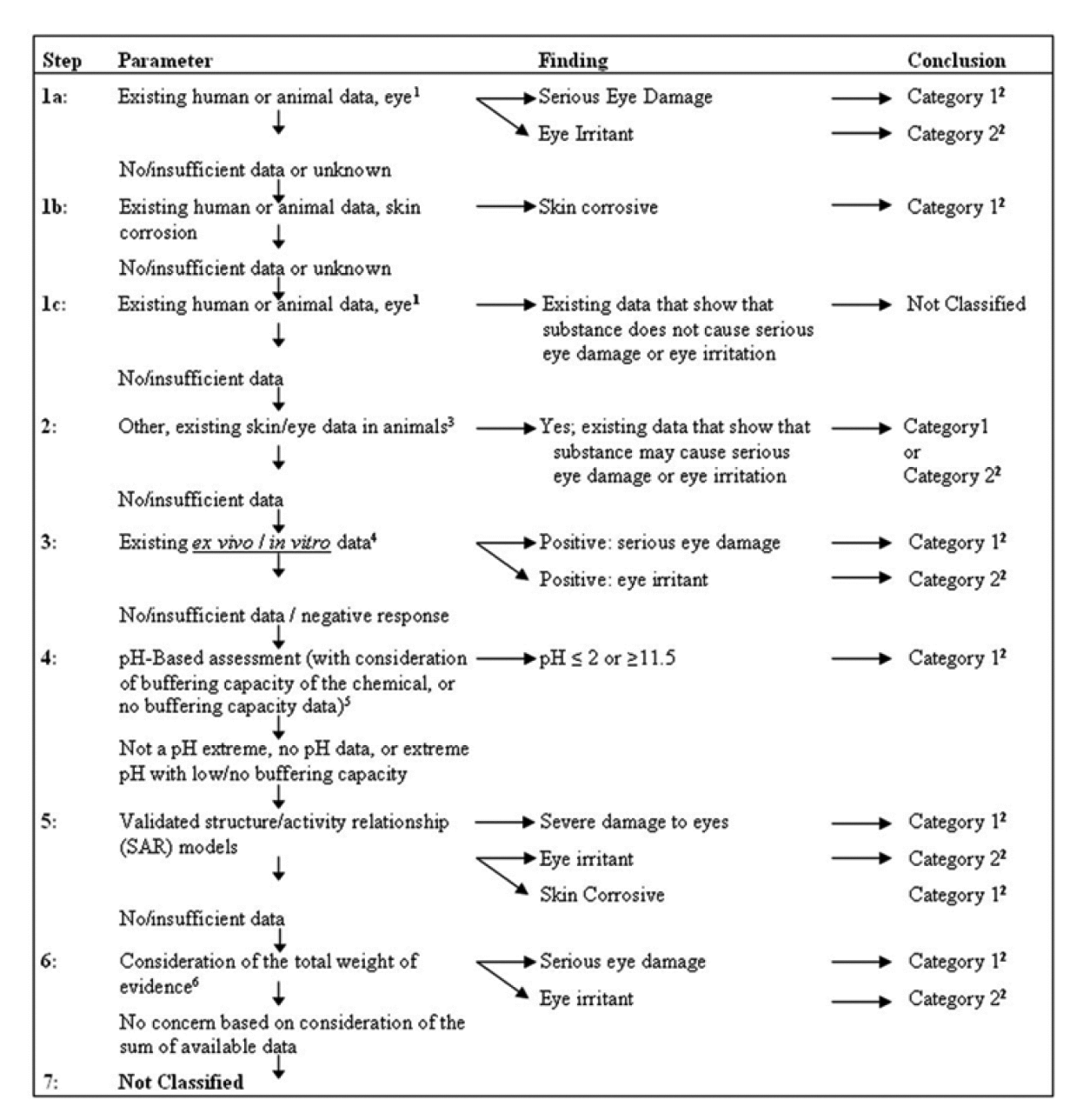
Figure A.3.1 Evaluation strategy for serious eye damage and eye irritation (See also Figure A.2.1)